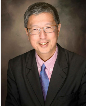
Chair, IEEE SIGHT Steering Committee