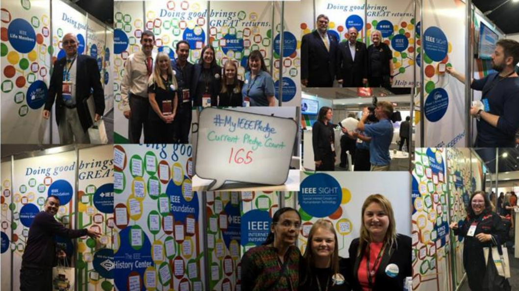
These are the people at the Humanitarian and Philanthropic Opportunities Pavilion at IEEE Sections Congress 2017 in Sydney, Australia, 12-13 August.