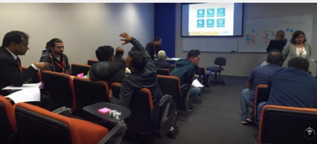
SIGHT hosted our first Train the Trainer Session on August 10th at IEEE Australia New Zealand Young Professional and Student Congress (ANZSCON) in Sydney, Australia. The 20 participants from SIGHTs and IEEE chapters around the world engaged in an exciting round of brainstorming and problem solving. A special thanks to the attendees.